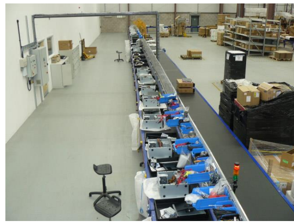
Figure 1: The assembly line of the industry 3.1 Main elements of conveyor system

Further, a brief discussion of the belt conveyor system is presented. Belt conveyors consist of a continuous loop. Half length of belt is used for delivering materials, and the other half is the return run. The belt is made of reinforced elastomers (rubber), so that it possesses high flexibility but low. Flexible belt, which is supported by a frame that has rollers or support sliders along its forward loop. Belt conveyors are having in two common forms:(1) Flat belts for pallets, individual parts, or even certain types of bulk materials; and (2) troughed belts for bulk materials. Materials placed on the belt surface travelled along the moving path way. In the case of troughed belt conveyor systems, the rollers and the supports give flexible belt a V shape on the forward (delivery) loop to contain bulk materials such as coal, gravel, grain, or similar particulate materials.